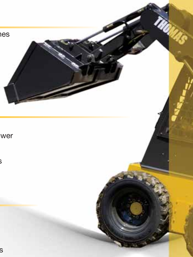
Lift Capacity, lbs